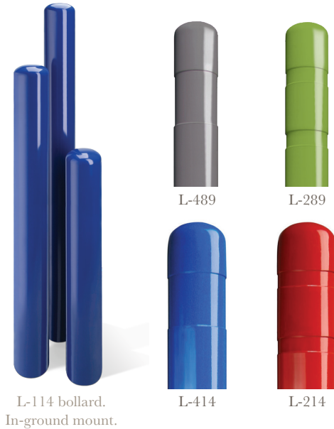
L-114 bollard. In-ground mount.

In-ground mount, except 5 ft (1.5 m) height.