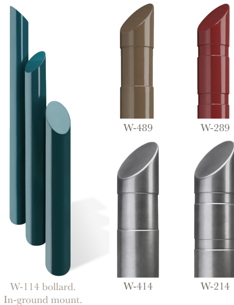
W-114 bollard. In-ground mount.

In-ground mount, except 5 ft (1.5 m) height.