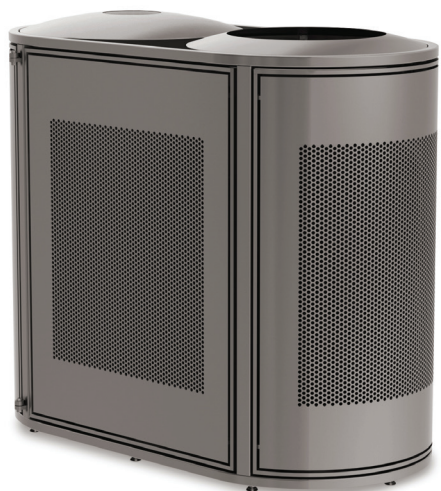
SGE-245SD Patent pending.