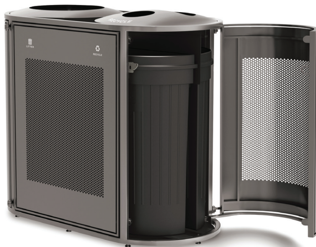
SGE-245SD Optional dual-flow lid and half-moon liners. Custom decals. Patent pending.