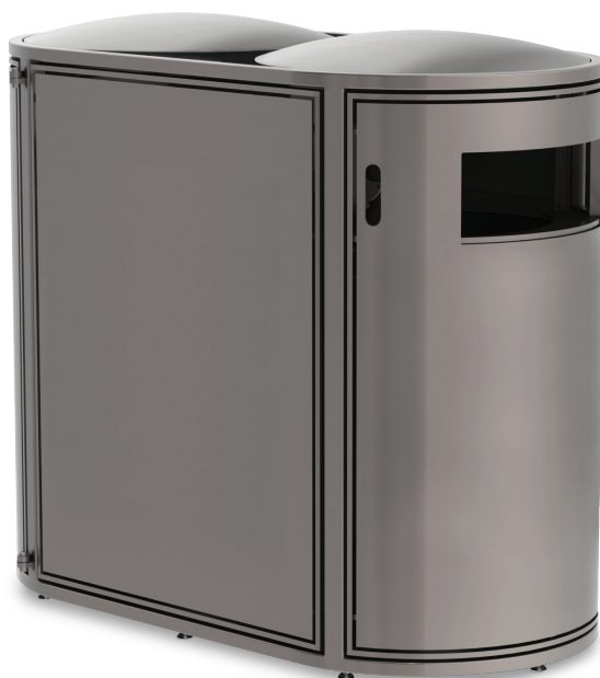
SGE-236SA Solid Panels. Patented.