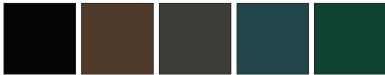
Black Bronze Tavern Square Green Teal Green