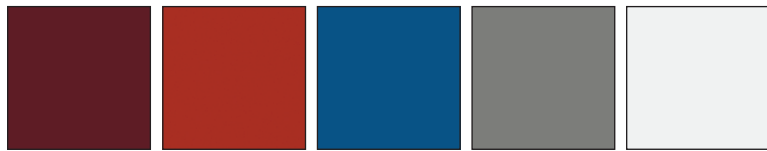
Burgundy Red Blue Gray White