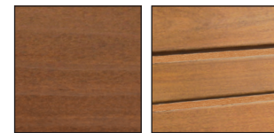
Kebony Wood Ipe Wood

Printed and digital color representations vary. Contact us for recycled plastic samples, wood samples or color swatches.