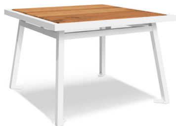
Ella coffee table. Wood slats.*