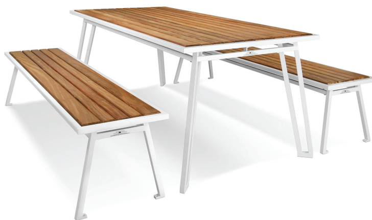
Ella table (patented). Ella backless bench. Wood slats.*