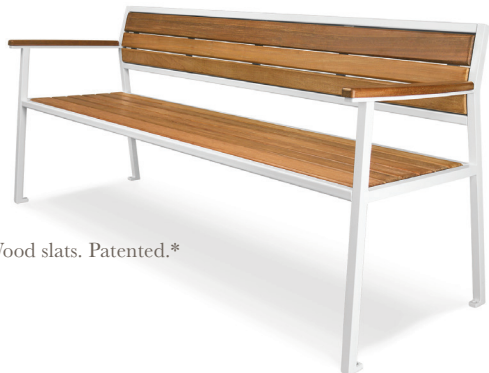
Wood slats. Patented.*