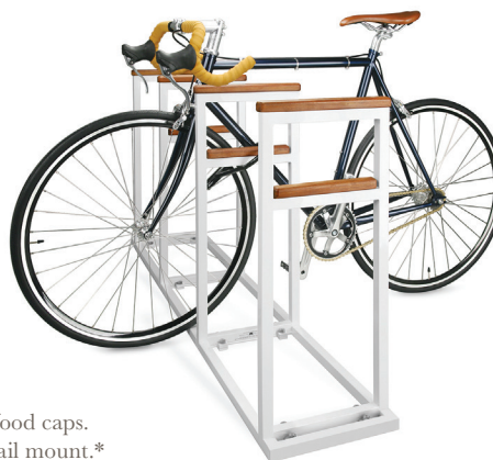
Wood caps. Rail mount.*