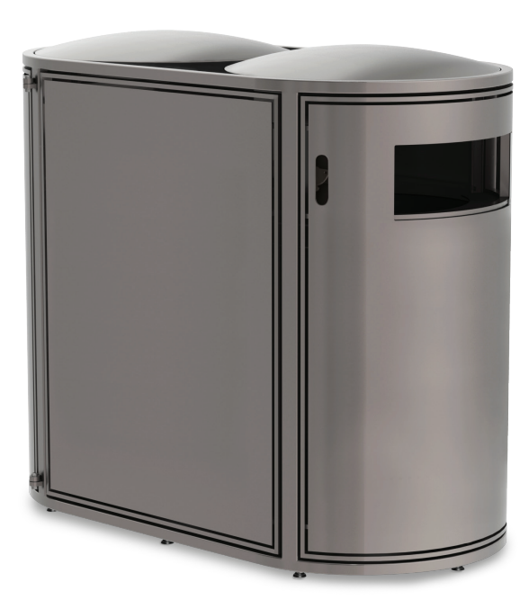
SGE-236SA Solid Panels. Patented.