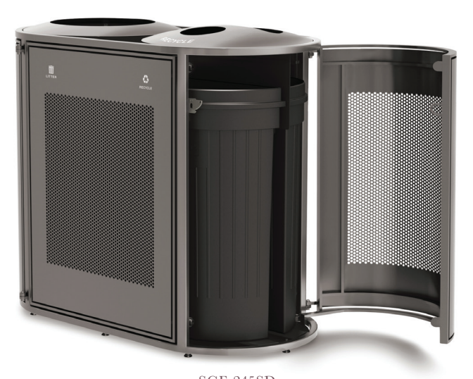
{\rm SGE-245SD} Optional dual-flow lid and half-moon liners. Custom decals. Patent pending.