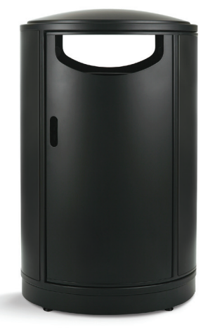
REN-36SDSD. Solid steel panels. Patented.