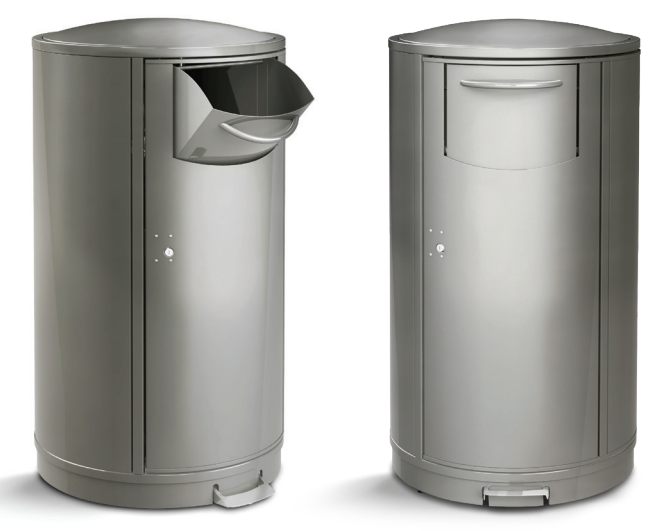
REN-36SDDD. Patent pending.

Introducing the Drawer Ren litter receptacle. This long sought after, fully-enclosed design, keeps waste in and rodents out to maintain your community's environment. It provides easy access via the drawer's handle or stainless-steel foot pedal, both rigorously tested for continued service year after year in even the harshest environments.