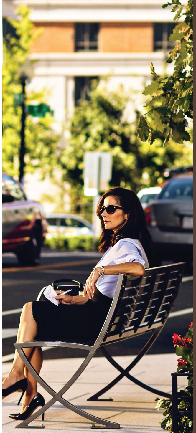
Steel slat seating. Patented.