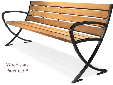
Wood slats. Patented.*