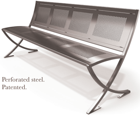
Perforated steel. Patented.