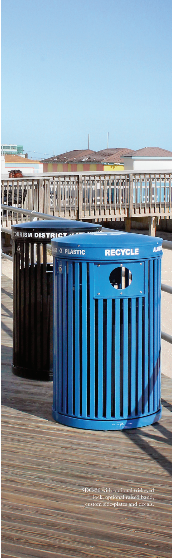
SDC-36 with optional tri-keyed lock, optional raised band, custom side-plates and decals.