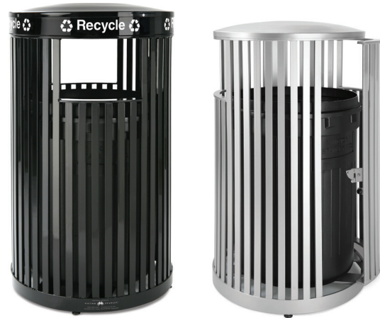
Raised band and decals.

Victor Stanley Relay® Sensor and Service available for select lids. Tri-keyed locking mechanism. Solid convex lid with raised band. Ashtray (standard or covered). Recycle lids. Half-Moon liners. Galvanized steel liner (powder coat available). Side-access plate with recycle holes. Custom decals and plaques.