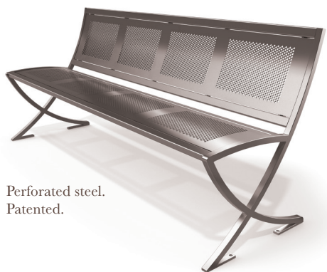
Perforated steel. Patented.