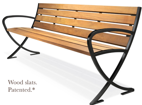
Wood slats. Patented.*