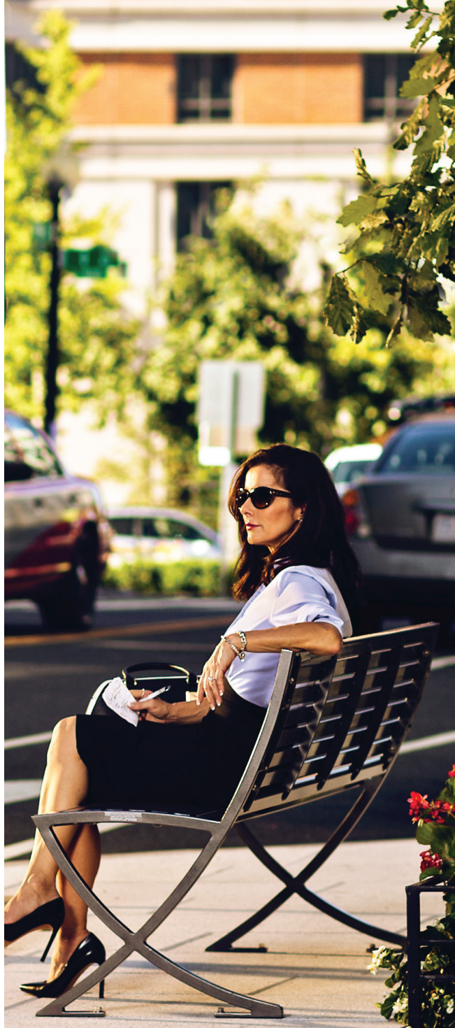
Steel slat seating. Patented.