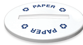
Slotted lid with decals.