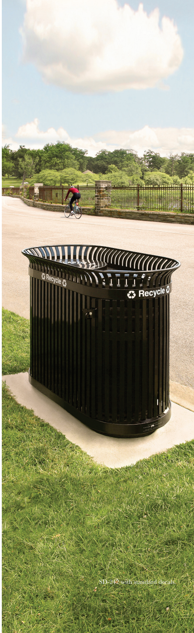
SD-242 with standard decals.