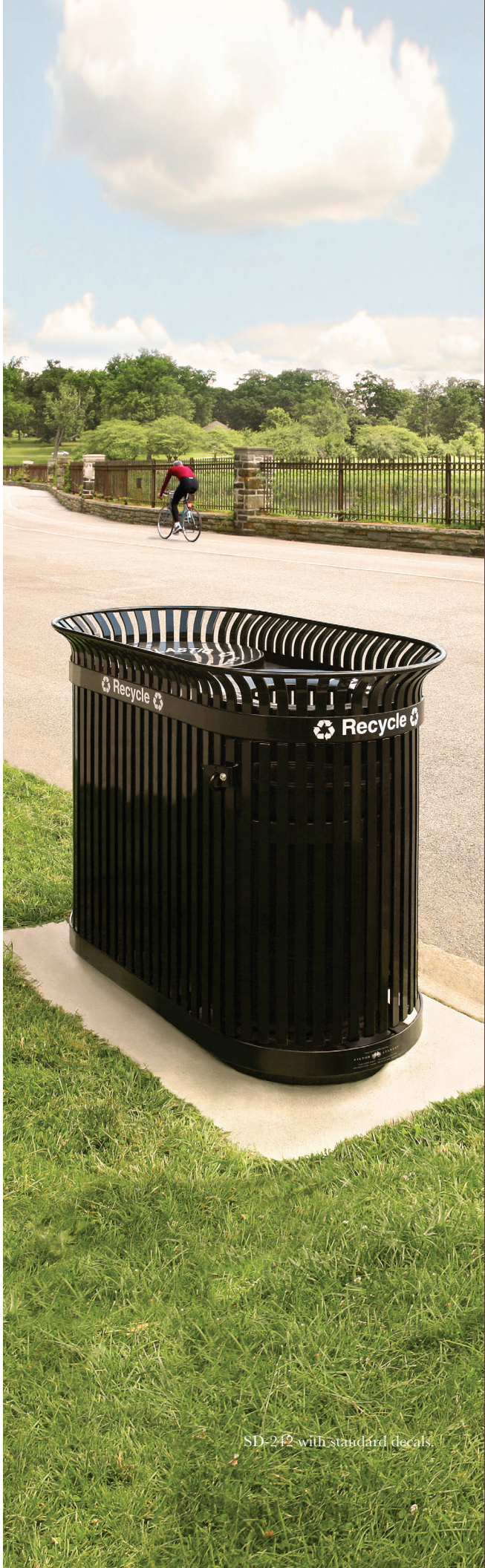
SD-242 with standard decals.