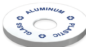
Recycle lid with decals.