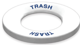
Tapered formed lid with decals.