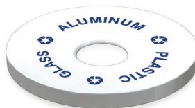
Recycle lid with decals.