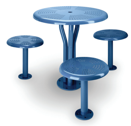
BIST-30R standard height bistro table. Patented. FBS-16R standard height backless bistro seats.