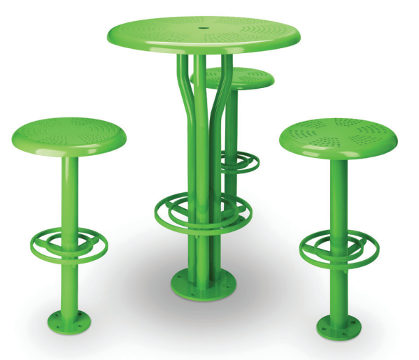
BIST-30R bar height bistro table. Patented. FBS-16R bar height backless bistro seats.