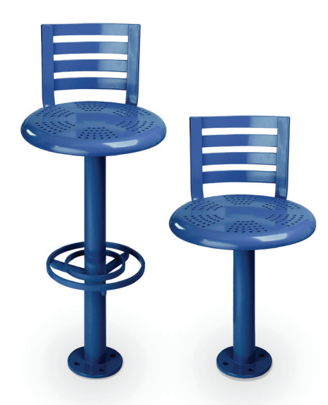
NBS-16R bar height and standard height bistro seats with backrests. \,