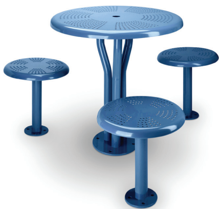
BIST-30R standard height bistro table. Patented. FBS-16R standard height backless bistro seats.