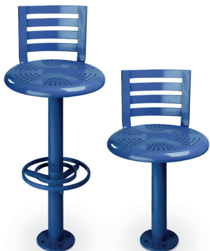
NBS-16R bar height and standard height bistro seats with backrests.