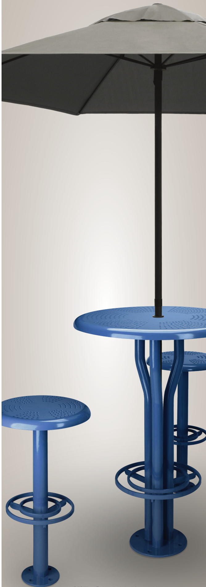
BIST-30R bar height bistro table. Patented. Umbrella not included. FBS-16R bar height backless bistro seats.