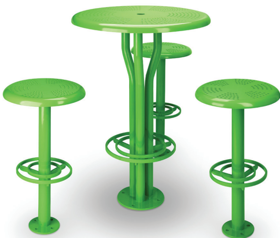
BIST-30R bar height bistro table. Patented. FBS-16R bar height backless bistro seats.