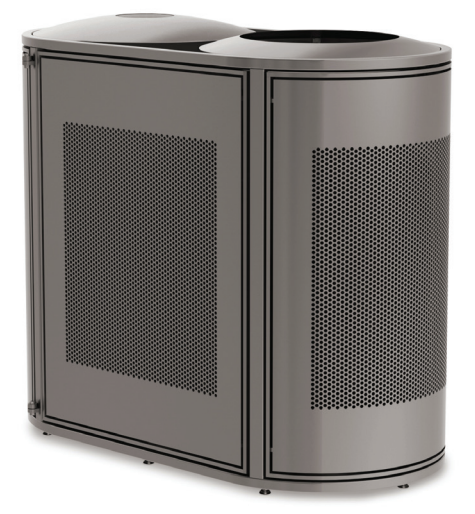
SGE-245SD Patent pending.