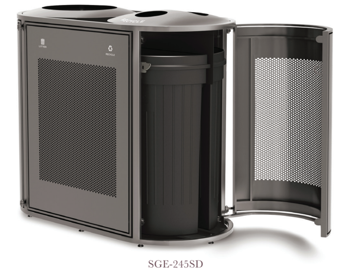
Optional dual-flow lid and half-moon liners. Custom decals. Patent pending.