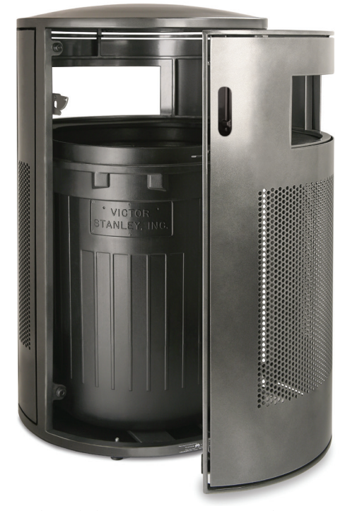
See product specifications for further details. Drawings are not to scale. Our TGIC powder-coating averages 8–10 mils (200–250 microns) thick and is applied in-house to ensure the highest level of quality. Offered in 15 standard, satin and metallic colors, plus a full range of RAL colors with available color matching. Additional cost may apply.