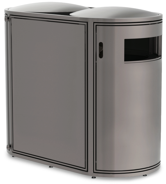
SGE-236SA Solid Panels. Patented.